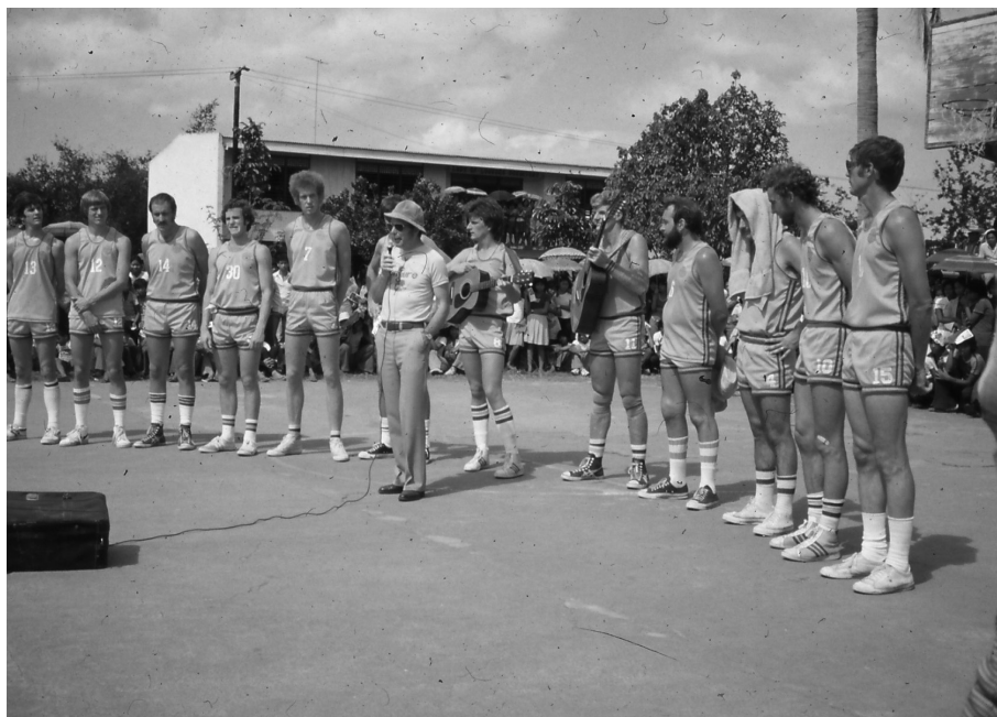
Figure 16. Half Time Evangelicalism

So, my experience with fundamentalism is not some removed, non-lived academic exercise. I understand the trajectory of fundamentalist certainty. On the VV tour I had some amazing experiences and we all took some high risks. It was the time of the Marcos military regime and of an evening it was martial law, the streets patrolled by the army and police. On the last evening before we flew home we took a risky drive through the back streets of Manila by taxi because our bus was delayed. We believed we were kept safe because of prayer and local Christians who knew how to bypass the military. On one occasion I remember people struggling with an extremist at a game and wrestling a gun off him.