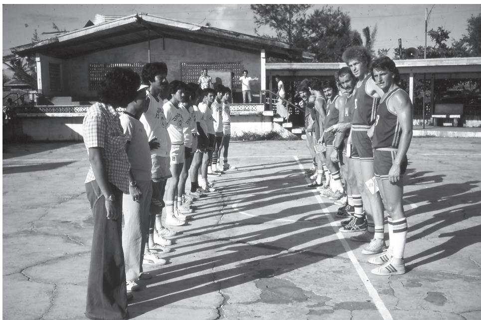
Figure 17. Game Number Two with Fresh Team

So I can tell you all about the trajectory of absolute certainty and fundamentalism, because I have experienced it and, thankfully, escaped from it. Fundamentalism is an ideology that seeks total control and dehumanises the very nature of what it is to be human. There is no freedom or love in fundamentalism. There is no tolerance or faith in absolutism. There is no openness, learning or listening in fundamentalism. Any ideology that promotes absolute control, absolute certainty and perfectionism is a dehumanising ideology.