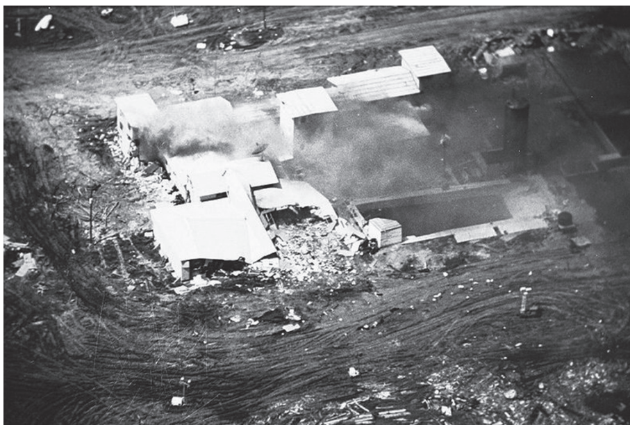
Figure 14. The Burning Compound of the Branch Davidian Ranch

The Branch Davidian story is an extreme example of the fruits of fundamentalism. The trajectory of fundamentalism has the potential for all dimensions of extremism including psychopathology justified by demonisation of the opposite.